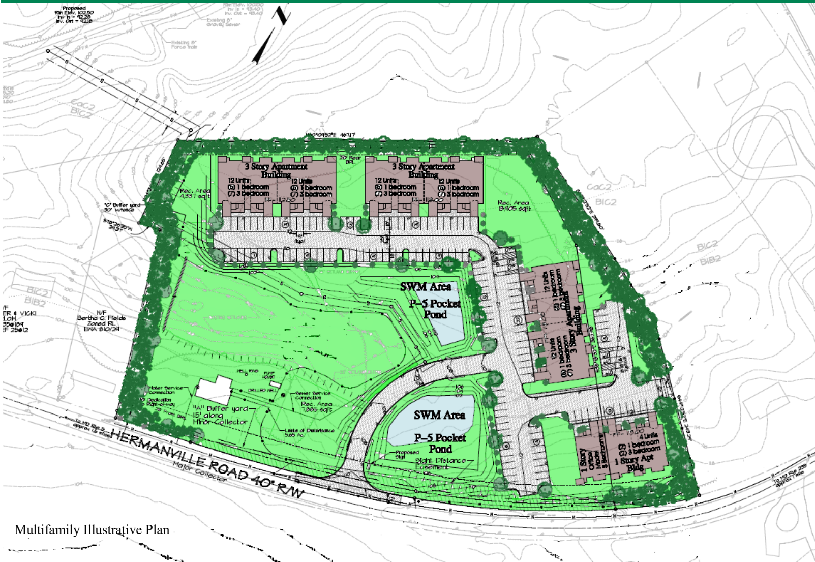
Multifamily Illustrative Plan